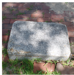
85-87 State Street House c.1840