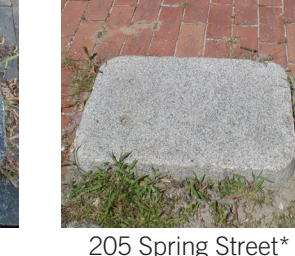
Frank D. True House, 1920