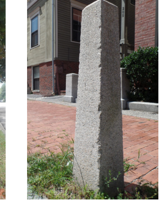
205 Spring Street* Frank D. True House, 1920